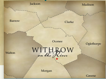
Oconee County Positioned for Residential Growth.