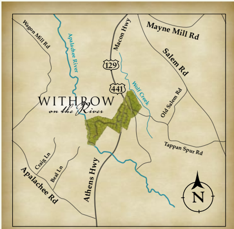
Large Lot Development Poised for Success.